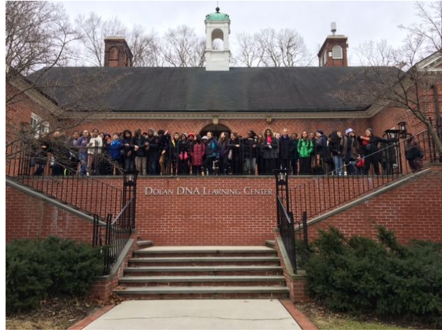
Scholars at the Cold Spring Harbor DNA Learning Center