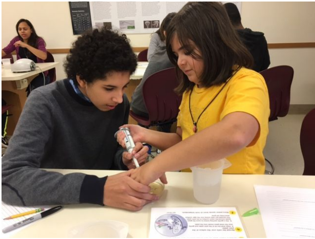
DNA recombination lab to create glowing bacteria!