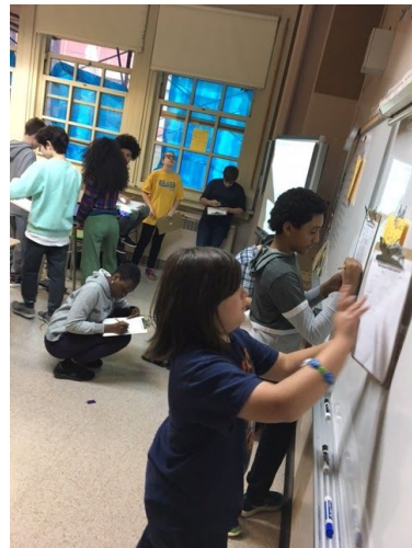
Scholars working hard on a Math scavenger hunt!